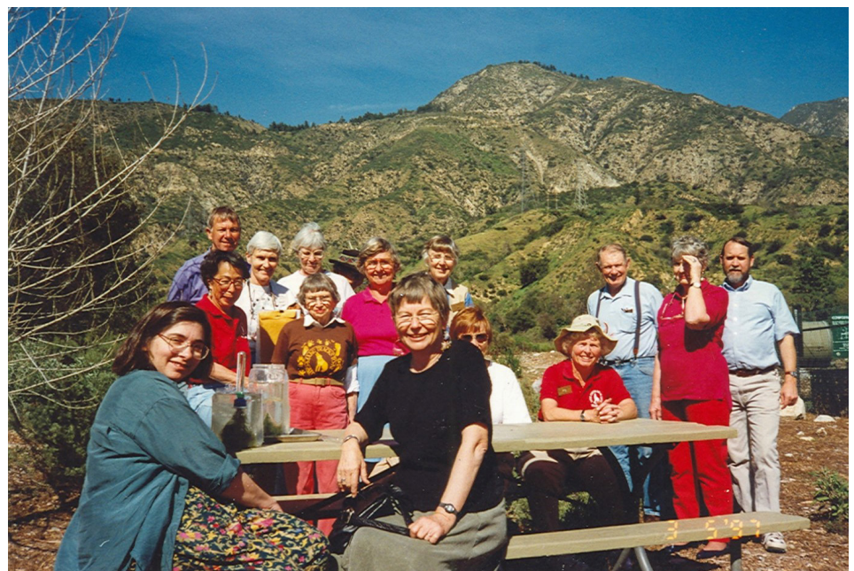
Docent Inservice, 1997