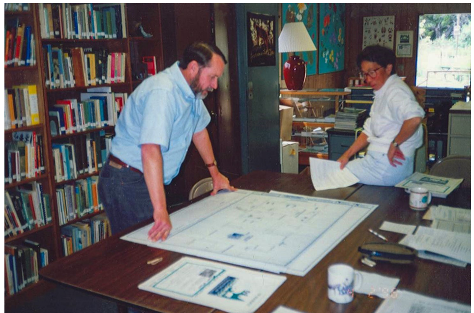
Rebuilt Nature Center planning