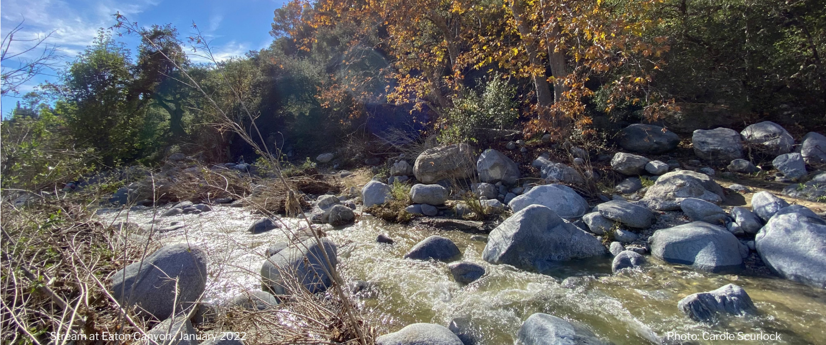
Stream at Eaton Canyon, January 2022