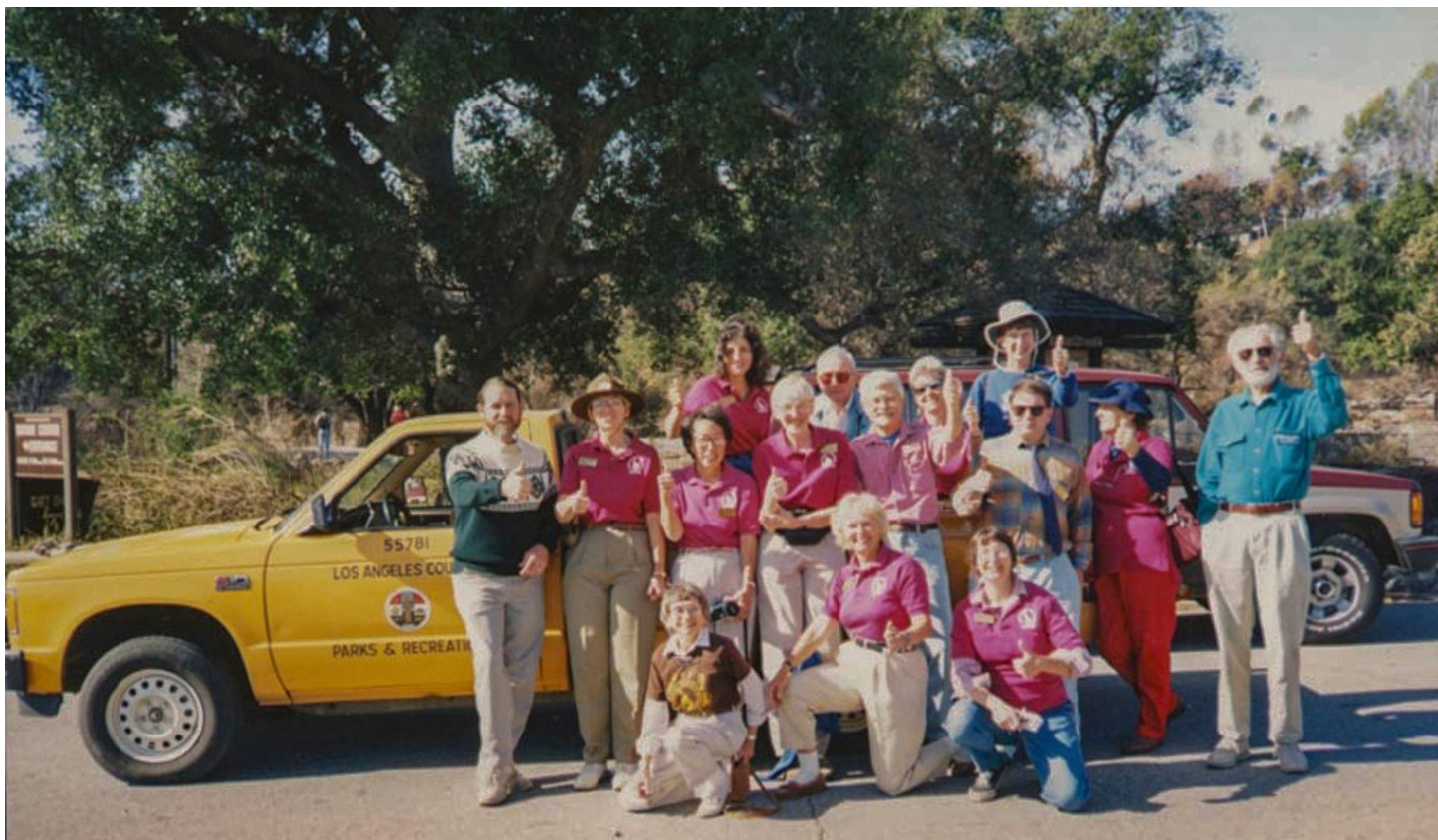
Post fire clean-up team