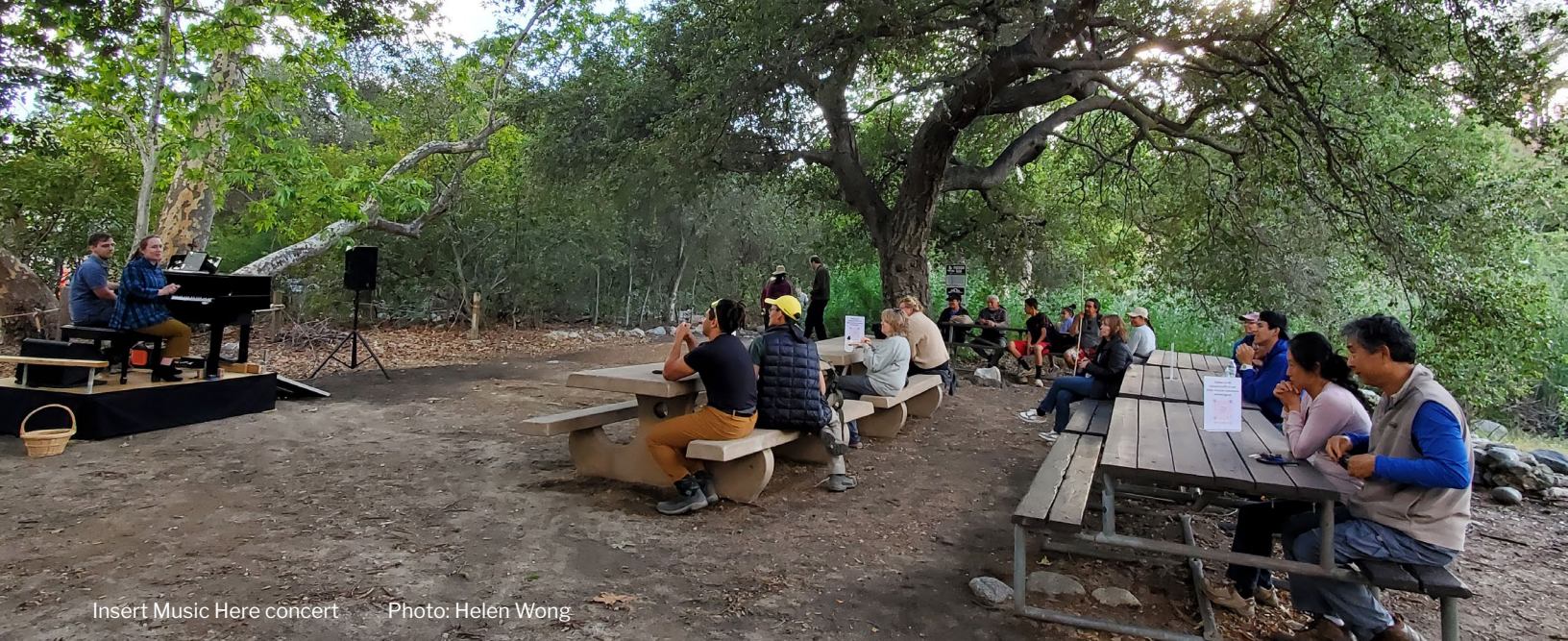
Insert Music Here concert