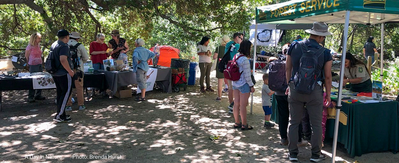
A Day in Nature