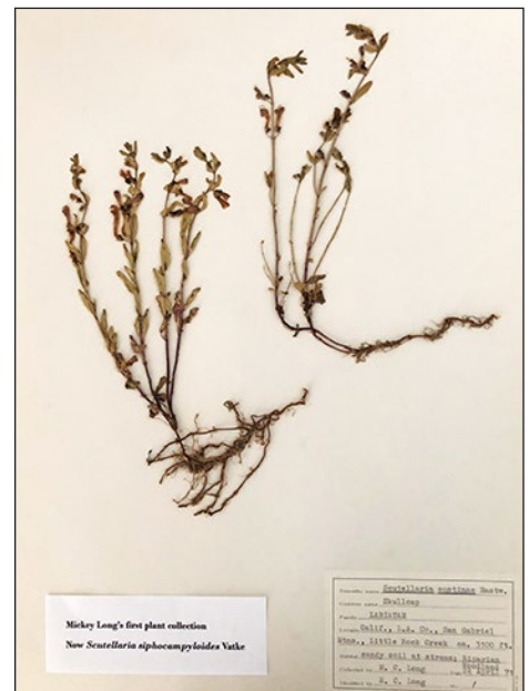
Mickey's first plant collection

For more than two decades, long before I retired, it was bothering me that there were hundreds of carefully collected, pressed and labeled plant specimens from all over Los Angeles County, resting in two herbarium cabinets and in some unsecured (from insect pests) cupboards at the Eaton Canyon Nature Center. They were collected from at least ten Natural Areas in our system and had value to serious botanists, but were not serving any real purpose at the Center. They dated from at least 1948 through 2022. A major collector, in addition to myself, was Ian Swift, former Placerita Canyon Superintendent. I knew these specimens belonged in a major scientific Herbarium collection, where these "vouchers" could be studied by botanical researchers, and California Botanic Garden Herbarium was the