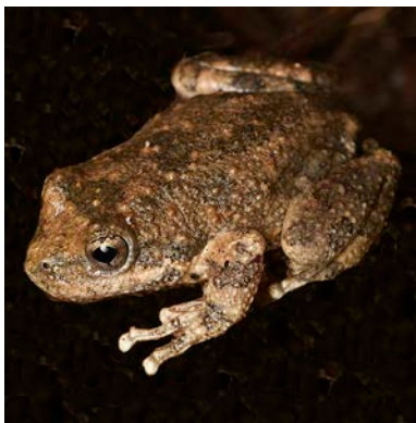
California Tree Frog

This night concert attains a crescendo in late summer or Autumn. Keeping things interesting, at any moment like a crowd of Valkyries barreling in to the chorus with a Hojotoho Hojotoho! overriding everyone, here comes the coyote pack. Don't worry, it isn't a kill song but mostly "Hey, how ya doin', I'm here, You here? You good?" etc. Never mind the lyrics, enjoy the song. Enjoy the concert, it's free and there's plenty of seating. ■