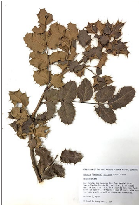
Herbarium sheet sample