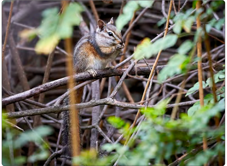
Merriam's Chipmunk - December 2022