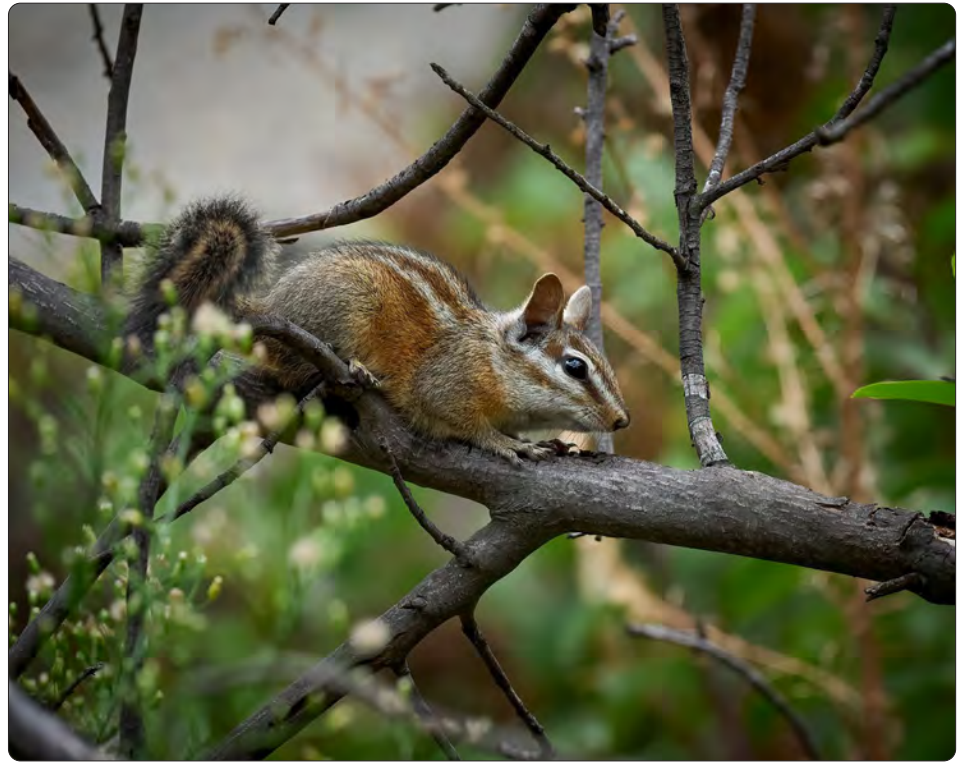
Merriam's Chipmunk - September 2023

species of plants and additionally consume insects and lizards, among other things. They are on the menu of a wide variety of predators, such as bobcats, coyotes, foxes, hawks, owls, rattlesnakes, gopher snakes, and king snakes.