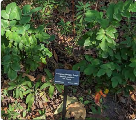
Creeping Oregon Grape sign