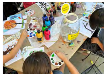
Young rising artist stars!