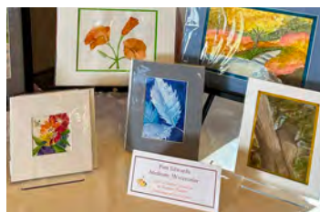
Pam Edwards - watercolors